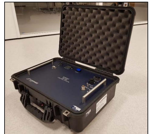
SONCAT Control Station (SCS)