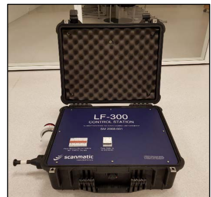
LF 300 Control Station